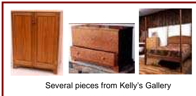
Several pieces from Kelly's Gallery